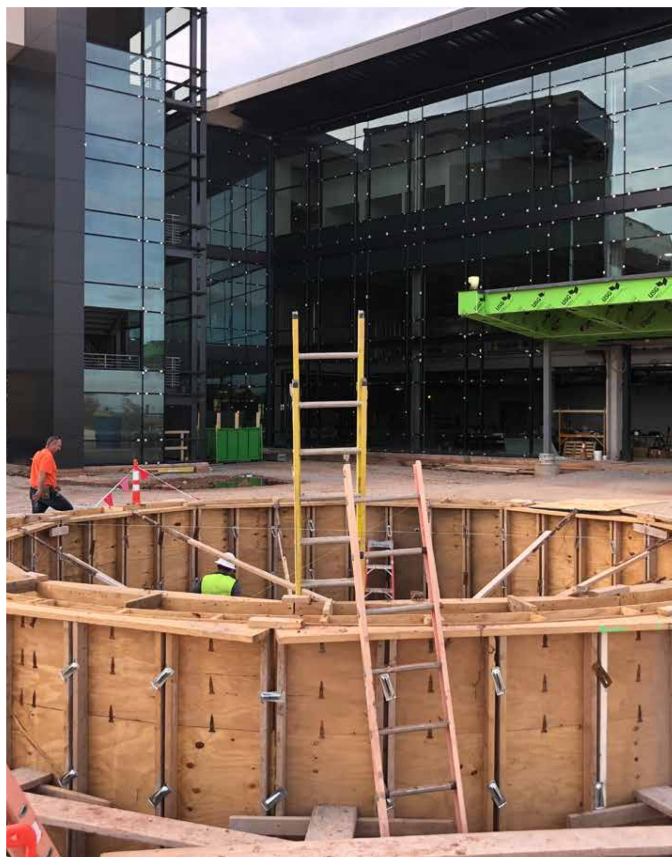
SECURA CORPORATE HEAD QUARTERS | NEENAH, WISCONSIN