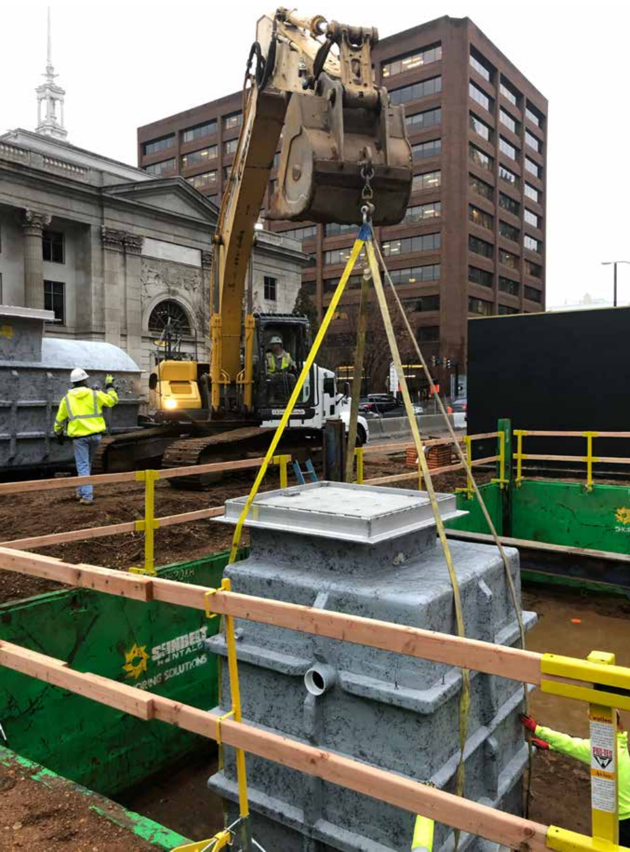
RODNEY SQUARE | WILMINGTON, DELAWARE