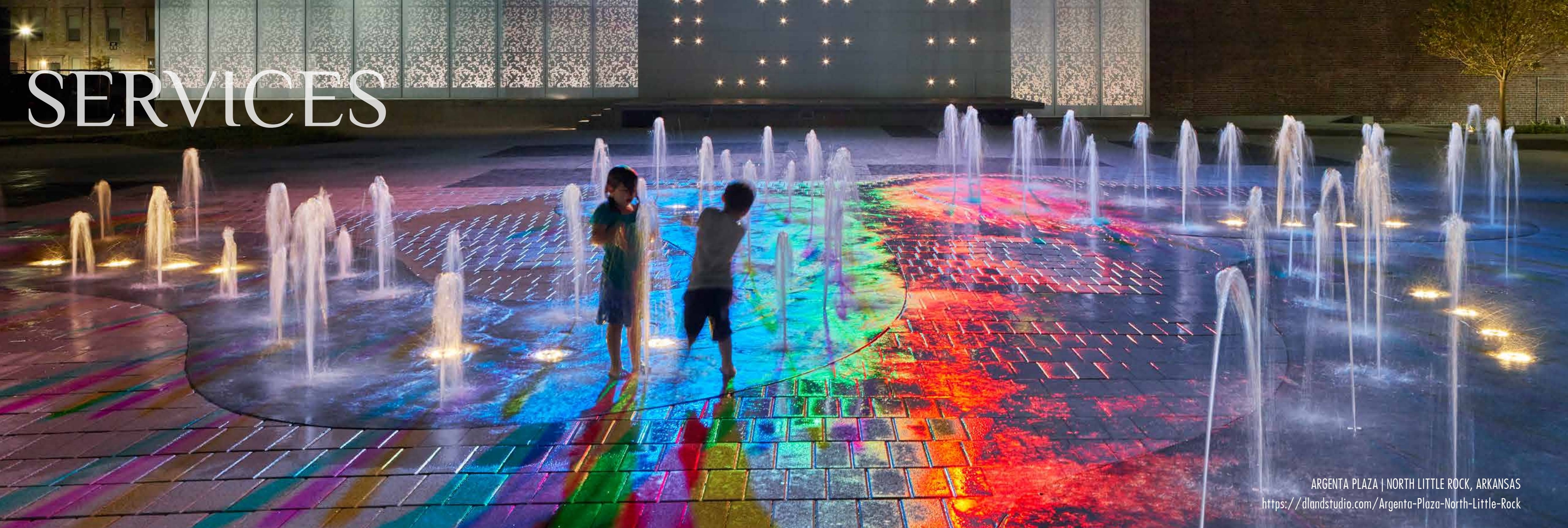
ARGENTA PLAZA | NORTH LITTLE ROCK, ARKANSAS https://dlandstudio.com/Argenta-Plaza-North-Little-Rock