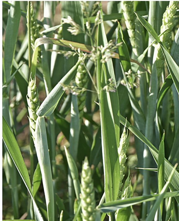
With Kito-R x Treatment

Kito-R x is your best ally when it comes to decreasing your pesticide use and improving your bottom line. It's a natural product that is effective at helping the plant protect itself against a large spectrum of plant stressors. Kito-R x has high carbon source nutrients that enhance the plants' uptake of your current fertilizers, allowing for a reduction in inputs and an improved return on investment.