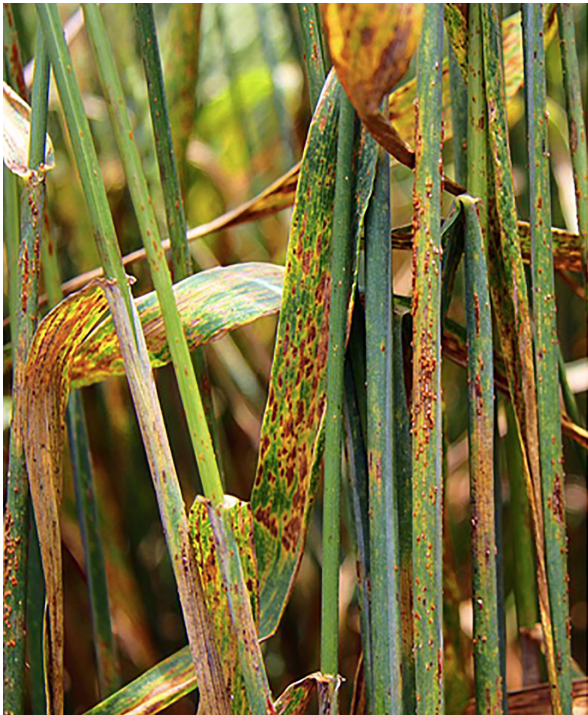
Without Kito-R x Treatment

Increases the number of helpful soil microorganisms and decreases harmful ones. Application of this fertilizer in the soil can control nematodes. It inhibits the breeding of nematodes by inducing the breakdown of chitin that destroys the epidermis of nematodes and their eggs.