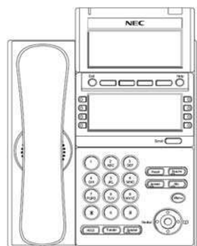
DESI Less 8 Button