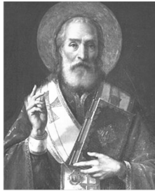
St. Nicholas, early Christian Bishop & defender of the faith.