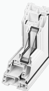
Casement | Awning