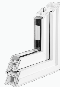
Tilt & Turn