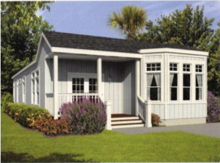
SHOWN WITH OPTIONAL EXTERIOR ELEVATION