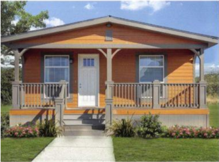
SHOWN WITH OPTIONAL EXTERIOR ELEVATION