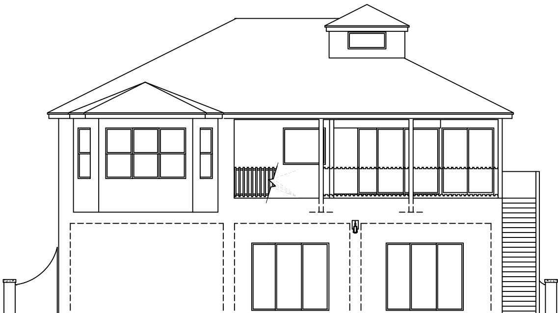
Gulf Side (Rear)