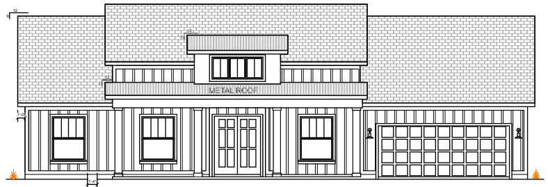
Optional Elevation "B"