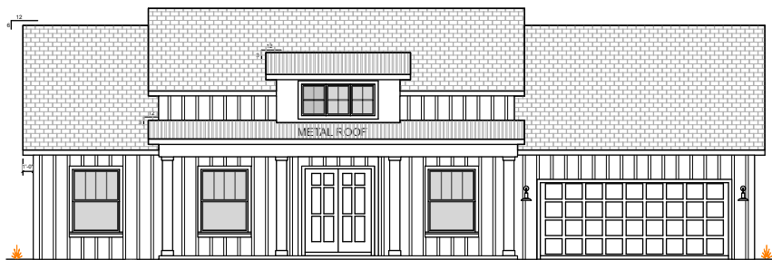
Optional Elevation "B"