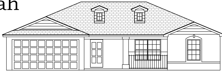
Optional Rustic Elevation " B"