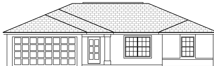
Standard Elevation "A"