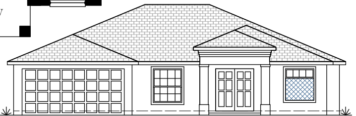
Standard Elevation "A"