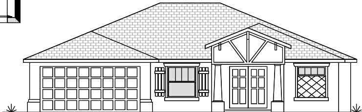
Optional Elevation "B"