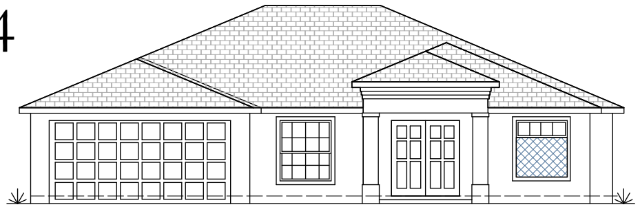
Standard Elevation "A"