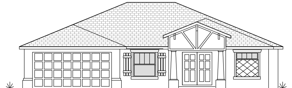
Optional Elevation "B"