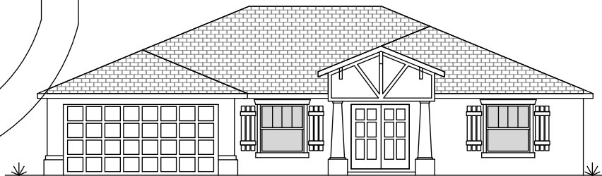
Optional Elevation "B"