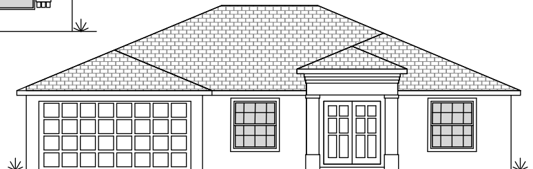
Standard Elevation "A"