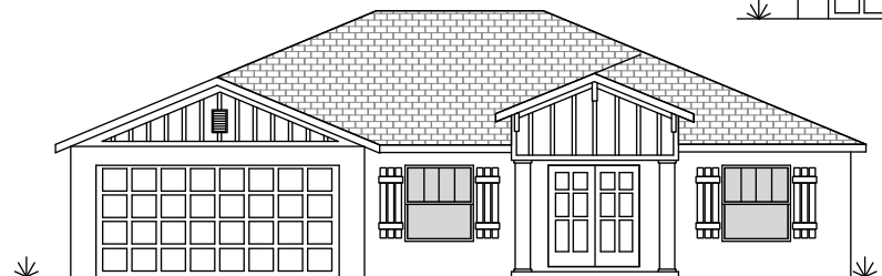
Optional Elevation "C"