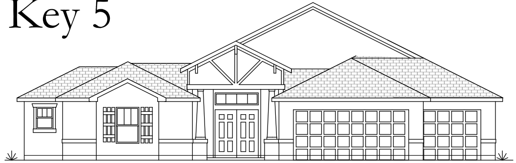
Standard Elevation "A"