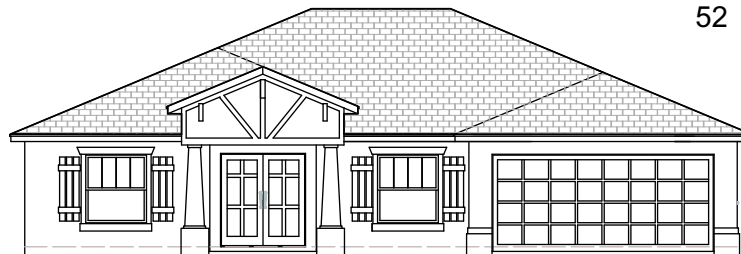
(OPT) Elevation B