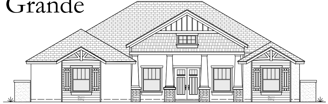
Standard Elevation "A"