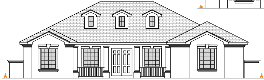
Standard Elevation "A"