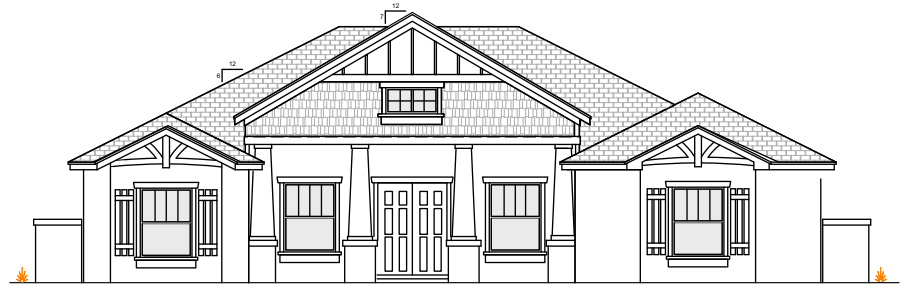
Elevation "B" (Optional)