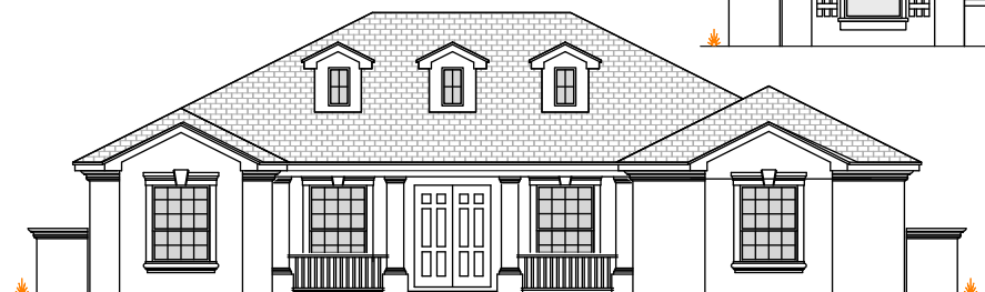
Standard Elevation "A"