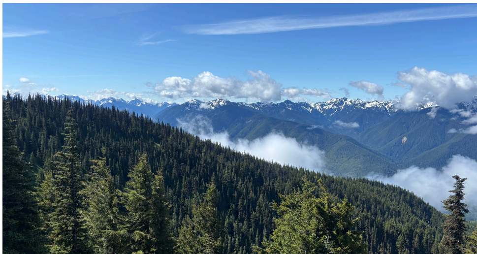
View from Hurricane Ridge

I'm still on vacation in the Pacific NW as I consider July. (Yeah, I know, but it can't be helped.) We just spent several days in the Olympic National Park, surrounded by an astonishing variety of natural wonders: Snow-capped peaks, 300-foot-tall trees, a glacier-carved lake, and the western-most beaches of the country. Jaw-dropping beauty was everywhere we looked. If you can get here someday, taking a couple of days before or after a cruise to Alaska (we saw many people hanging around Seattle, waiting to board), you really should! I'll give you some recommendations when I get back.