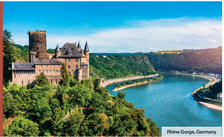
Rhine Gorge, Germany

May 20-27, 2027 | AmaLucia 7-night cruise from Basel to Amsterdam