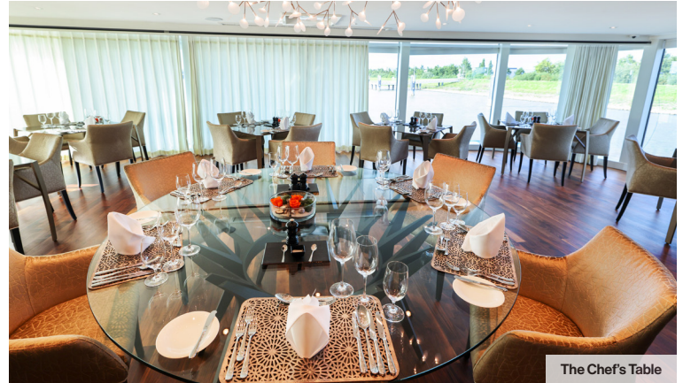
The Chef's Table