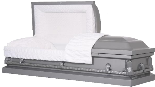
Winston Silver – 20 Gauge Steel

Both of our economical burial packages include the family's choice of one of the following caskets: