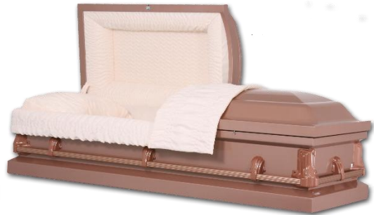
Winston Coppertone – 20 Gauge Steel