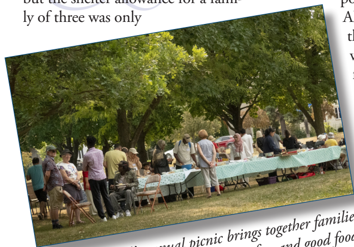
Picnic: OMRA's annual picnic brings together families and supporters for a day of summer fun and good food

grocery cards from local stores and sells them to participants. The stores pay OMRA 4%-5% of the value of the cards. Glebe-St. James United Church, St. Thomas the Apostle Anglican Church, The Society of Friends (Quakers), St. Joseph's Catholic Church, Temple Israel and several groups of friends and colleagues joined the Ottawa Mennonite Church and Emmanuel United Church in supporting OMRA's grocery card program. Today, over 250 people and ten groups buy OMRA grocery cards every month.