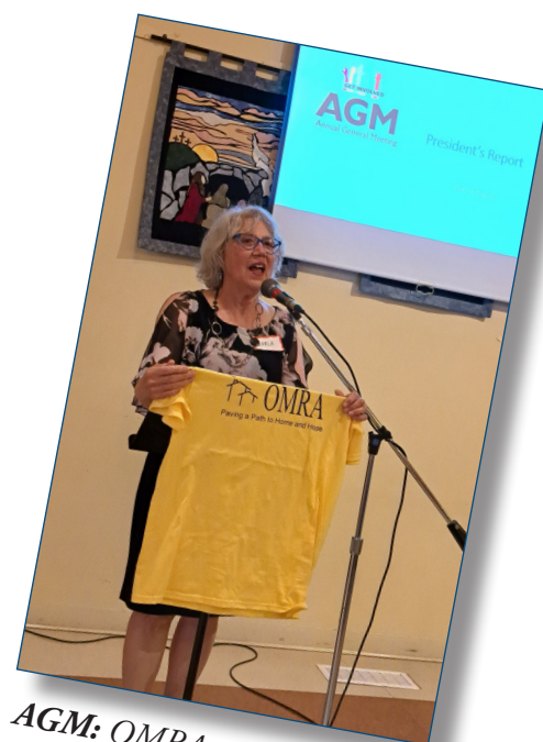
AGM: OMRA members get an annual update