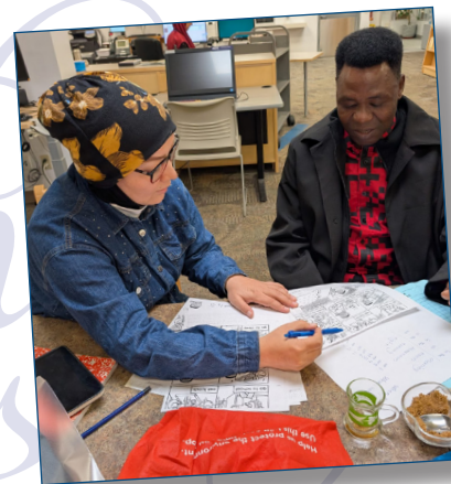
Tutoring: OMRA volunteers provide a friendly face and language support

card program to generate sustainable funding. OMRA purchases