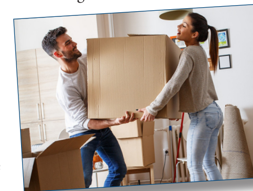
Moving: OMRA provides kitchen goods and linens and facilitates moving day with partners like Helping with Furniture

To augment the grocery card program, OMRA has been working hard at