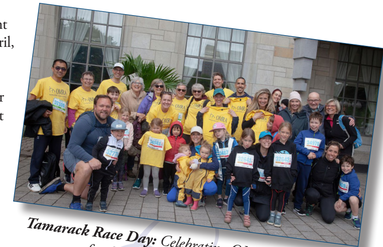
Tamarack Race Day: Celebrating OMRA and raising funds at Ottawa's Tamarack Race