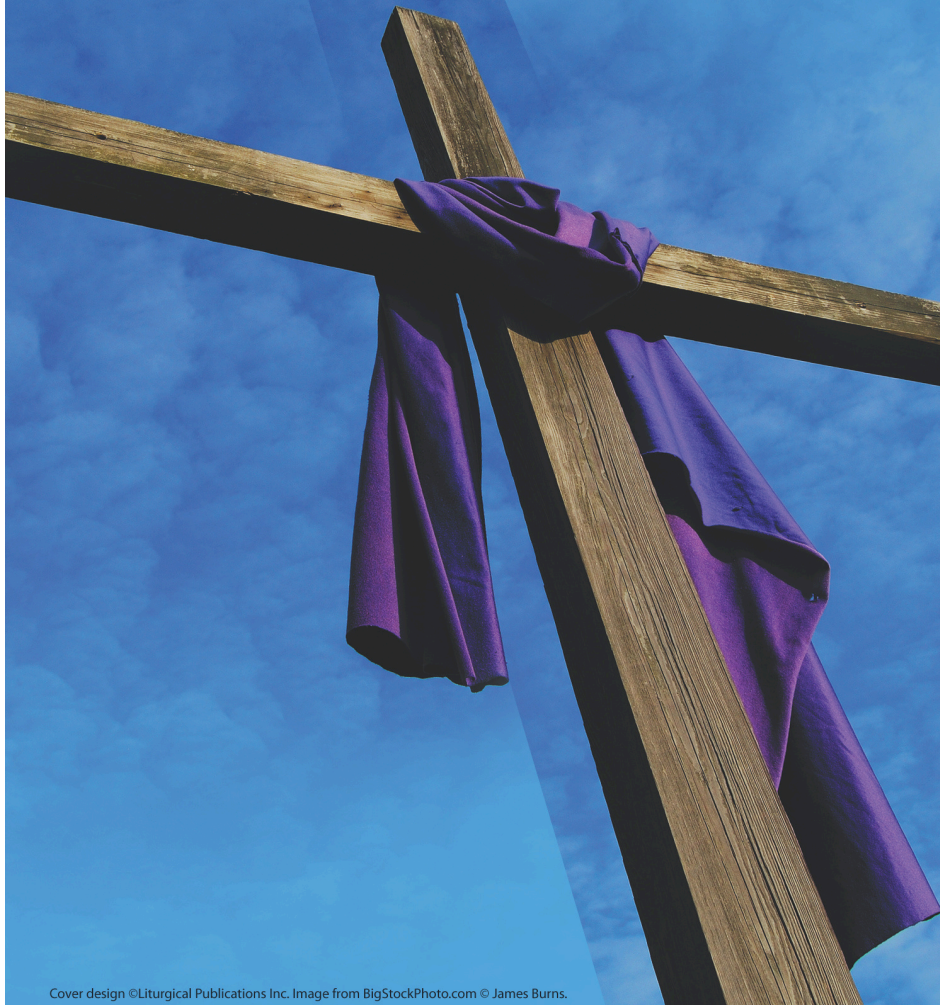
Cover design ©Liturgical Publications Inc.