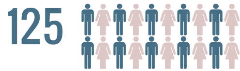
Number of students from across Canada impacted by GLBCs educational ministry in 2022 and 2023

6 Number of provinces that we have visited or from where students attended