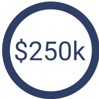
Approximate amount donated through planned giving in 2022-2023