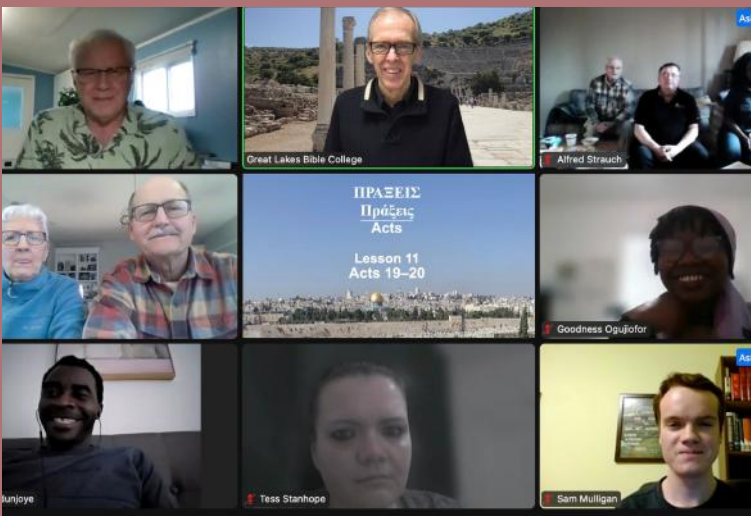
Students, including Group from Regina, SK auditing the Book of Acts.

This short course, which is currently in session, began on March 7, and will continue until April 25. This eight (8) week course is offered online and at hybrid sites, for two (2) hours per week. In this class, we are examining the Gospels, and the historical content into which Jesus came to learn what Jesus has revealed about what we should believe, what we should do, and who we should be.