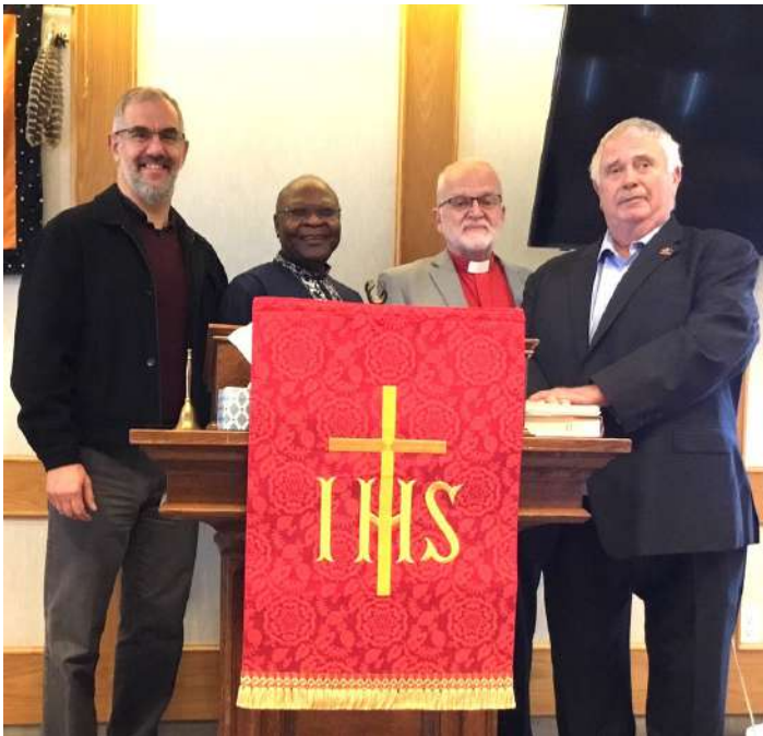
DUC celebrated our 7th Anniversary in our building on Sunday, November 23.