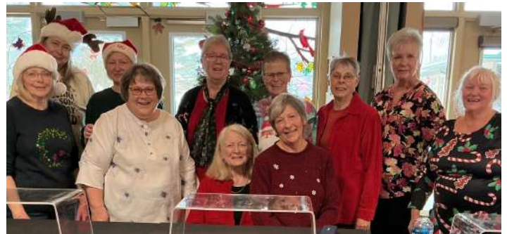
Dunwich Highland Ringers took our show on the road in December to Bobier Villa to entertain the residents.