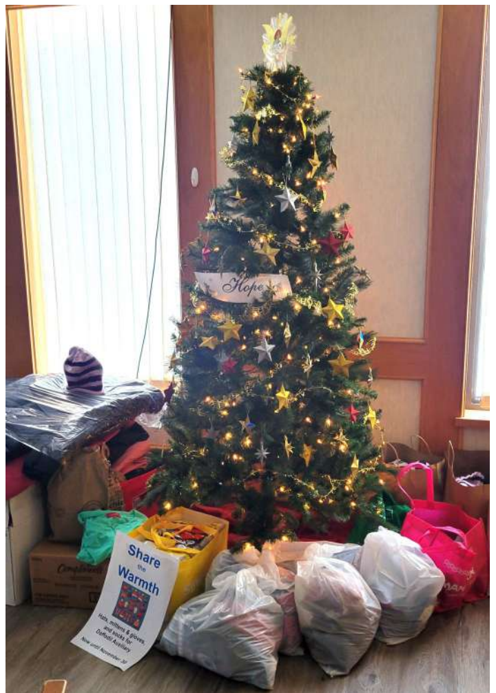
Share the Warmth 2025: our Church Family is so generous. Thank you! All of this collection was delivered to West Elgin Daffodil Auxiliary-Welfare.