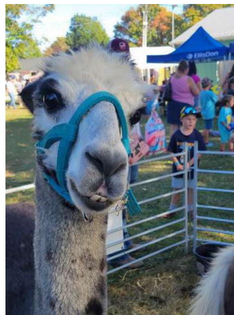
An Alpaca at the Wallacetown Fair Petting Zoo. Careful he doesn't spit at you!!