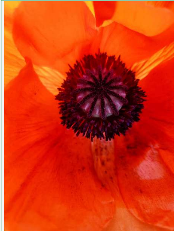
Image: Poppy in Late Sunlight

We are one in this space, in this building, in this community, in this world. We are one through the generations, through song and word, through worship. We are one just as we are. All are welcome here.