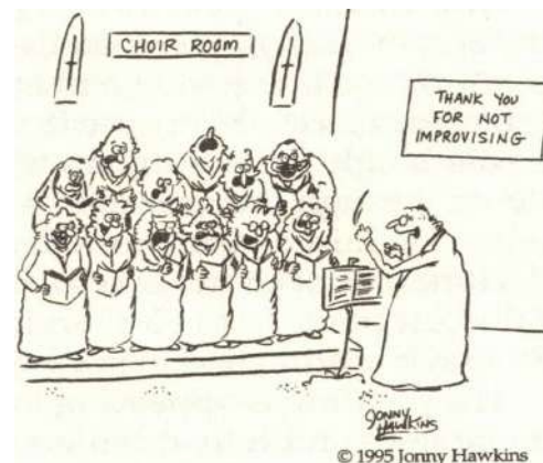
Holy Humor, pg. 73