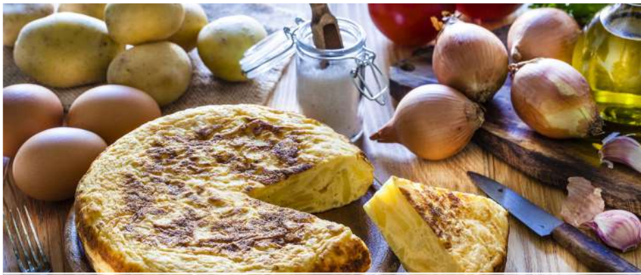
Lawrence Station Hall breakfast is cancelled for April due to Easter Sunday.