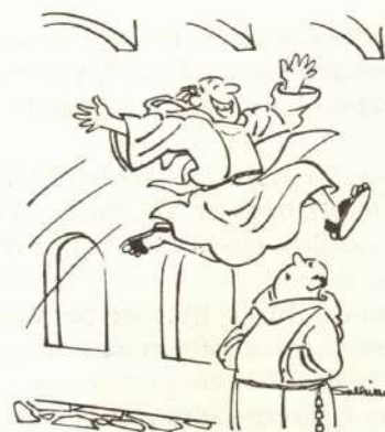
"Cool it with the spiritual joy, Brother."

To read some prayers and the Scripture Please see any member of the Worship Team to volunteer. We appreciate your involvement in our Services.