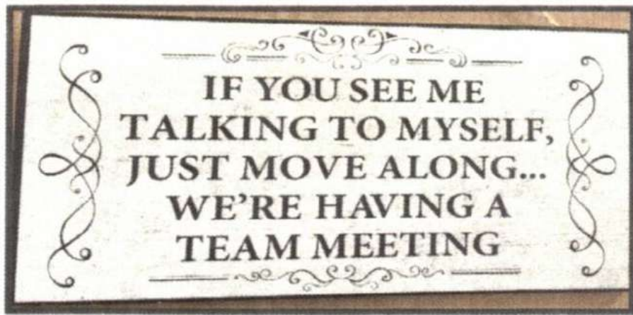
JoyfulNoiseletter, Mar./Apr. 2026. Pg. 8.