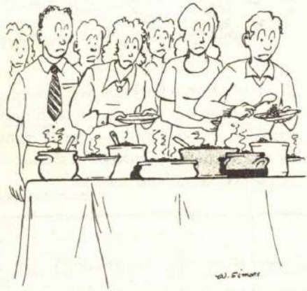
The inevitable finally occurred — a potluck with nothing but baked beans.

Next Sunday is the Annual General Meeting immediately after the Service. It will be followed by a Pot-Blessed Lunch.