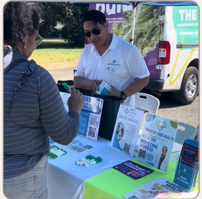
Amity Medical Group staff working at the bulb market!