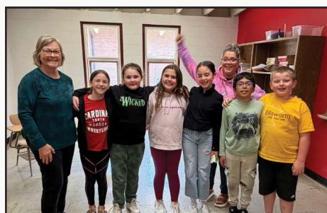
4th grade class pin champs