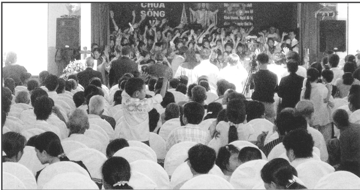
Hundreds of Vietnamese pack into a hotel banquet room this Spring and again in July to hear the gospel openly preached, many for the

In general conditions remain very difficult for many of these faithful workers, but in some areas there are dramatic improvements being noted. With warming relations between the USA and Vietnam, a new attitude of friendliness is being extended by the government to underground pastors affiliated with recognized church denominations.