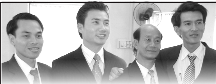
Please pray for these newly ordained Free Methodist pastors who are 'testing the waters' by registering their churches with the government

These Brothers have been faithfully serving the Lord for many years, pressing ahead in spite of great adversity and pioneering a trail for many others to follow. It's been such a joy to see them coming back together after many years of isolated struggling. A fresh partnership has been formed that draws on a deep friendship among them, rooted in the trials of years spent together in the refugee camps in Hong Kong as young men.