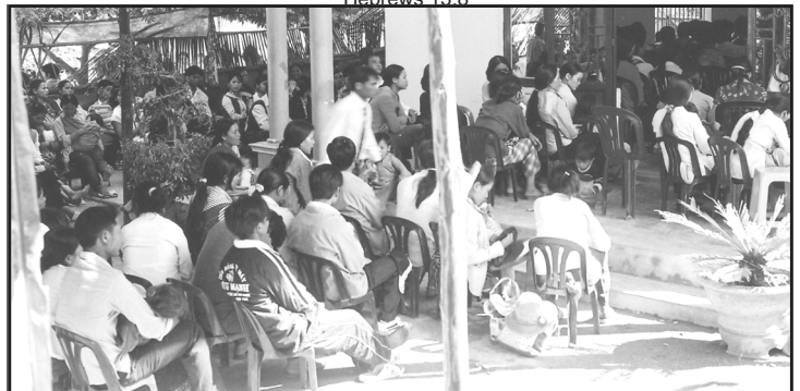
Overflowing out the doors at an 'underground' Church in Vietnam

T hank you so much for your generous support of around 100 'house church' Vietnamese pastors and evangelists over this past year of 2008. We recently received this brief report from Vietnam about the result of your investment.