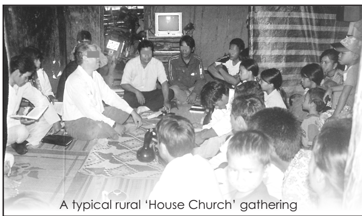
A typical rural 'House Church' gathering