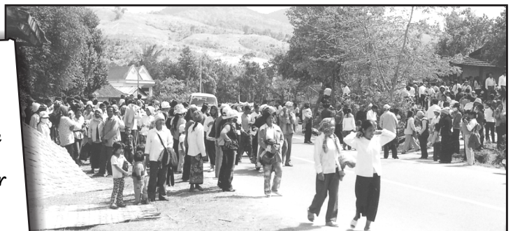
Christians flock to an 'underground' church in Vietnam!

I am looking forward to seeing you. Love, Bro. * *