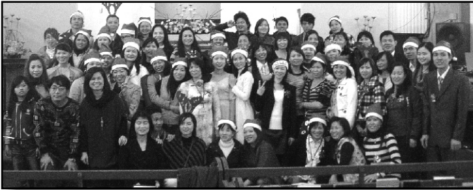
Many of these Vietnamese Christian leaders in training in Taiwan will soon return to North Vietnam to serve the Lord.

It would greatly help the Northern Vietnamese people who have returned back from Taiwan to maintain the evangelical Spirit which they had in Taiwan.