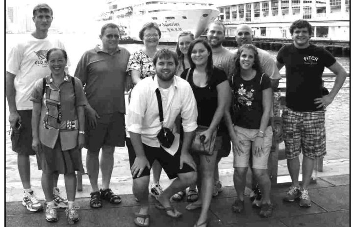
The June 2010 Bible Courier Team An evening of sightseeing at Hong Kong Harbor

How can we have such success when China still does its best to prevent Bibles crossing the border?