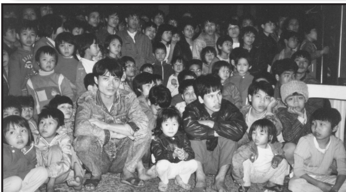
Many young Vietnamese Refugees heard the gospel for the first time in the Hong Kong Detention Centers. Now years later they are re-emerging in Vietnam, strong and vibrant Christian leaders, out of the soil of

Rest in anticipation of seeing God's name glorified by