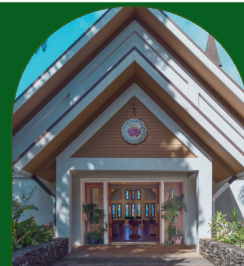
Sacred Hearts Mission Church 550 Office Road Lahaina, HI 96761

THE BEACONS OF THE CATHOLIC FAITH ON THE WEST SIDE OF MAUI