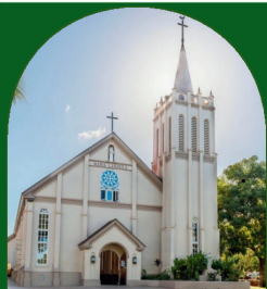
Maria Lanakila Catholic Church 712 Waine'e Street Lahaina, HI 96761