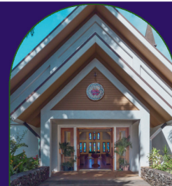
Sacred Hearts Mission Church 550 Office Road Lahaina, HI 96761

THE BEACONS OF THE CATHOLIC FAITH ON THE WEST SIDE OF MAUI