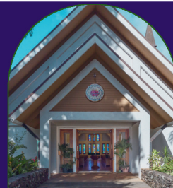
Sacred Hearts Mission Church 550 Office Road Lahaina, HI 96761

THE BEACONS OF THE CATHOLIC FAITH ON THE WEST SIDE OF MAUI