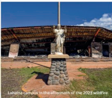
Lahaina campus in the aftermath of the 2023 wildfire.

Today, we write a new chapter. A story of resilience, rooted in love, and built on the strength of our community.