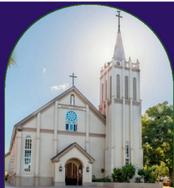
Maria Lanakila Catholic Church 712 Waine'e Street Lahaina, HI 96761