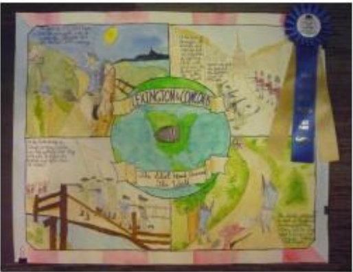
The Americanism Poster Contest

"The objects of this Society are declared to be patriotic, historical, and educational...." -Constitution of the SAR Article II