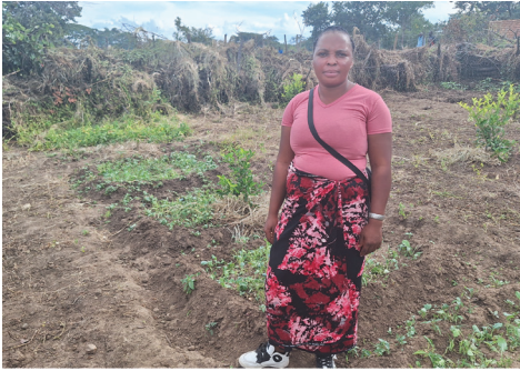
FfF - a good harvest of sweet potatoes, which were sold to buy maize seed