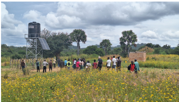
Established borehole in Mapanza