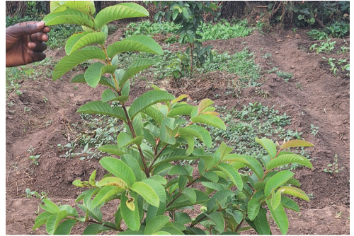
Tree planted in 2025 quickly growing