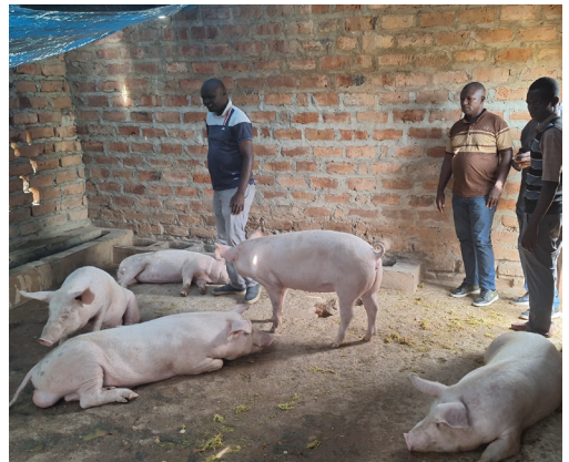
Pigs in excellent condition