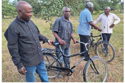
Buffalo bikes - transport for area coordinators