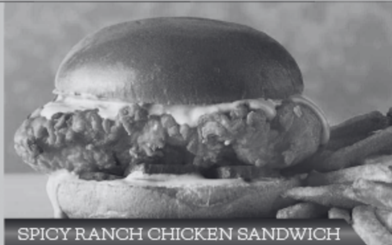
SPICY RANCH CHICKEN SANDWICH

One FREE refill with meal purchase, NO Refills on Root Beer, Bottled Water or Juices Coke, Diet Coke, Mr. Pibb, Sprite, Iced Tea, Lemonade, Root Beer, Milk, Bottled Water, Coffee — Juices: Orange, Cranberry, Tomato, Grapefruit, and Pineapple