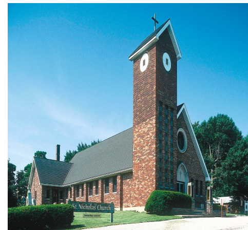
Saint Nicholas - Pocahontas