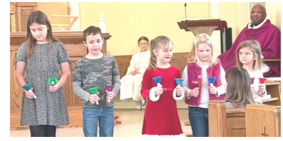
Bell ringers at St. Gertrude performed at last Sunday's Class Mass. Children are from the PSR Classes.