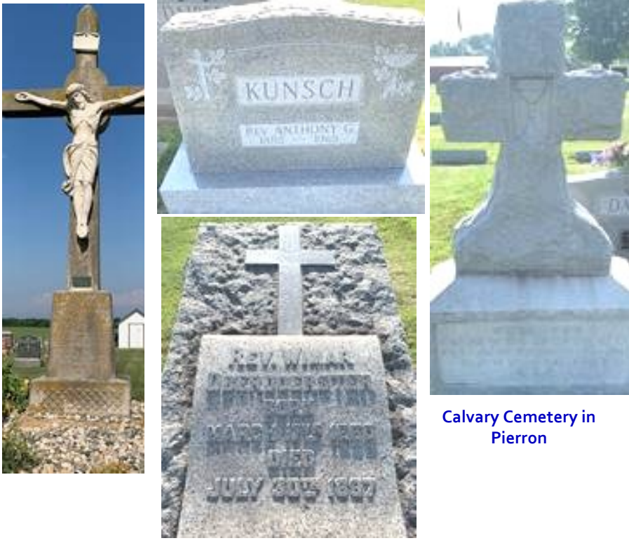
Calvary Cemetery in Pierron

HACSM is asking for donations of the following items to fill their Back-To-School backpacks. They are due by July 15th. Any size donation is appreciated! Post-it Notes, Colored Pocket Folders (3-ring), Red & Green Pocket Folders, Index Cards July Pantry Needs: Canned Mixed Fruit & Canned Pears HACSM can always use monetary donations to allow them to purchase additional items as needed. All food donations will still be accepted no matter the above assignment each month. We appreciate your support! Thank You!