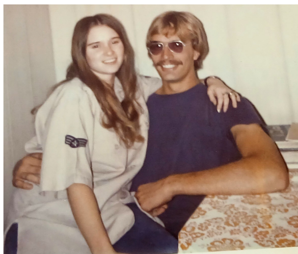
Guess who?? Circa 1975

Hitz Home Auxiliary Presents: June Salad Luncheon on Friday, June 5th at 1pm. Join us for an afternoon of fun and fellowship at Hitz Home Activity & Dining Room in Alhambra; Donation is $8.00. We invite you to bring your favorite appetizer, dish, or dessert (a variety of meats will be provided). Share a delicious meal, silent auction, entertainment and raffle.