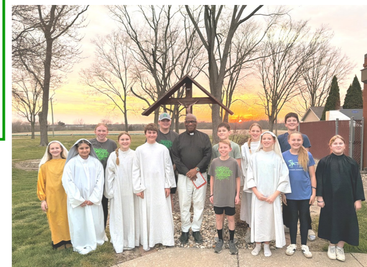
PAPAYA Youth Group who performed the Shadow Stations of the Cross at IC last Wednesday

We will also put the names of grads from the 3 parishes in our bulletin; Please call or email the parish office with your grads name, school & degree (if in college) if you would like them listed.