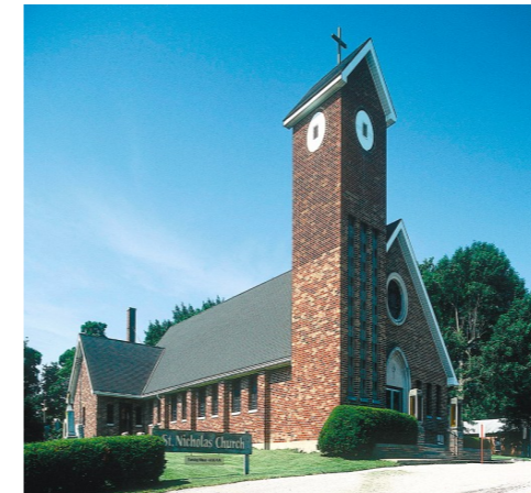
Saint Nicholas - Pocahontas

Dear Jesus, May your mercy flow over us, filling our gaps and healing our wounds. Open our hearts more deeply with knowledge of your love for us, understanding of the depth of your passion, and trust in your never-ending mercy. Amen.